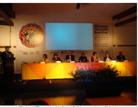
Quito (Ecuador), 8 - 12 November 2011. CECA VIII Regional Conference

Beautiful convents, churches and the city historical center that are considered by Unesco as World Heritage completed this very fruitful event!