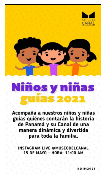
Posters and photos of the activities in March in the framework of the celebration of the International Museum Day 2021.