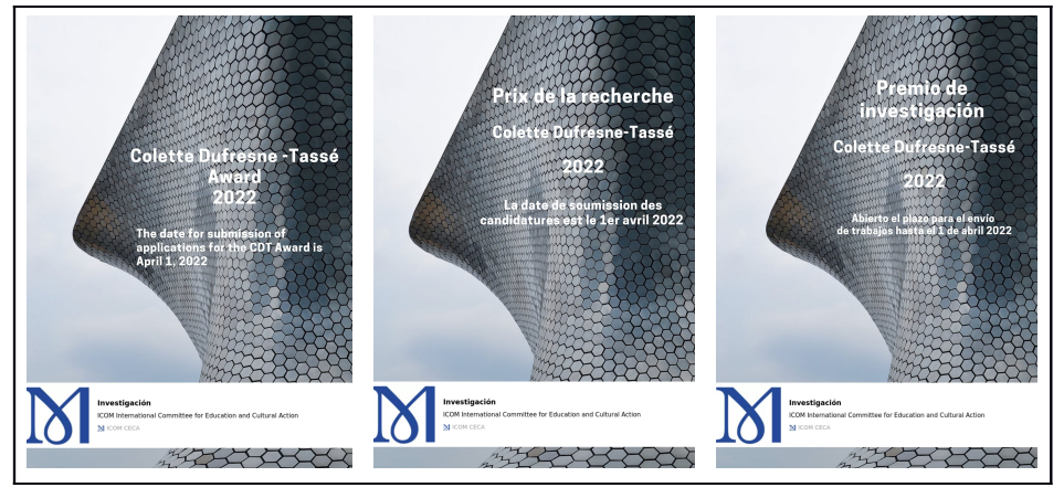
Figure 1. InfographicsColette Dufresne-Tassé Prize 2022

Information is provided on the Colette Dufresne-Tassé research prize and CECA members are encouraged to apply by sending in their work. In addition, infographics are designed for the dissemination of these calls on the CECA website.