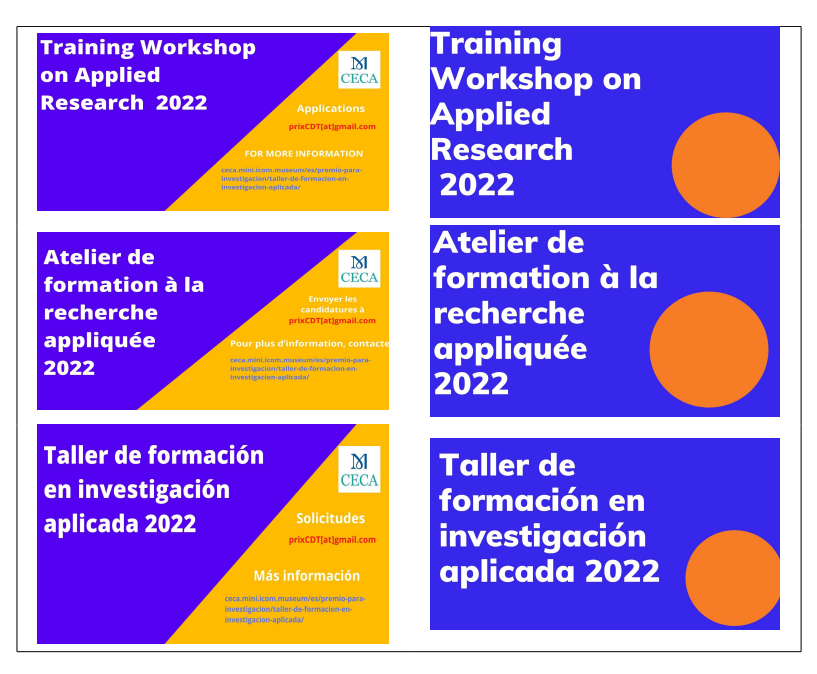
Figure 2. Infographics for disseminating the 2022 applied research workshop

In addition, information was provided on the research workshop to be held during the annual conference, requesting that a project or a research report carried out in the museums be sent in advance so that it can be analysed during the workshop. This call has been disseminated on the CECA website and by e-mail.