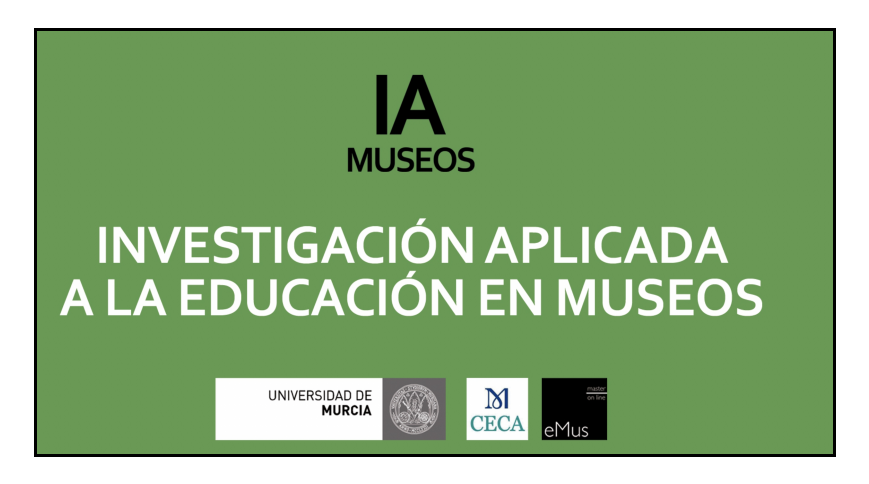
Figure 5. Infographic of the proposals of the online course on Research Applied to Museum Education

Given the interest aroused by the training received in the applied research workshop and the request received from CECA LAC, an online course on Applied Research in Museum Education has been designed. It is initially aimed at ICOM CECA partners (postgraduate museum students and university-trained museum professionals from Latin America). This course will shortly be submitted for approval to the ICOM CECA Board of Directors.