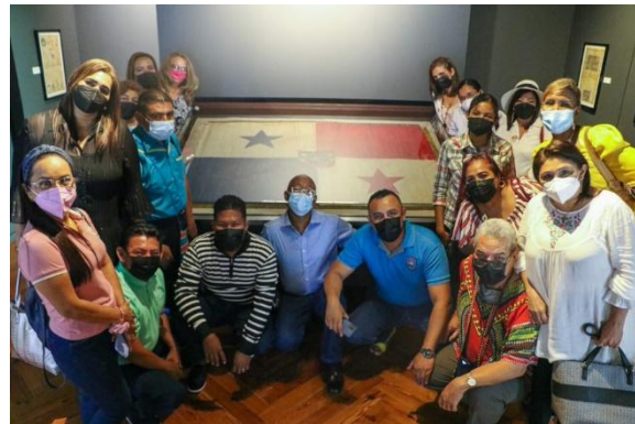
Educators, in their history teaching training at the Canal Museum