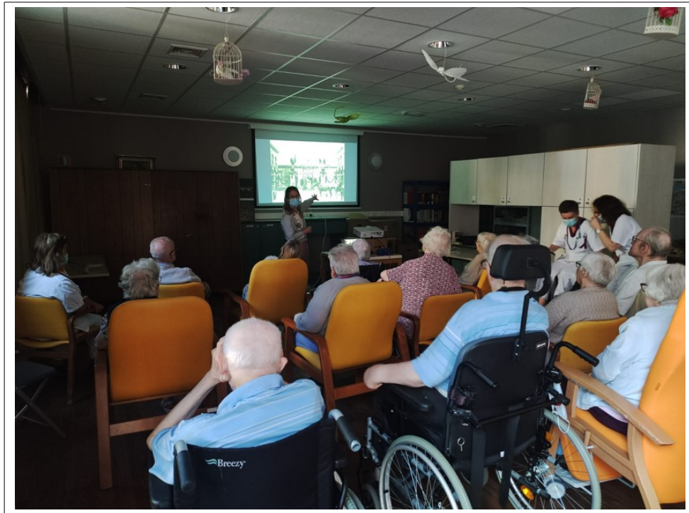
2 pictures: 3 and 4

Project: Solidarity Project ICOM Belgium – ICOM El Salvador, with the support of ICOM Solidarit