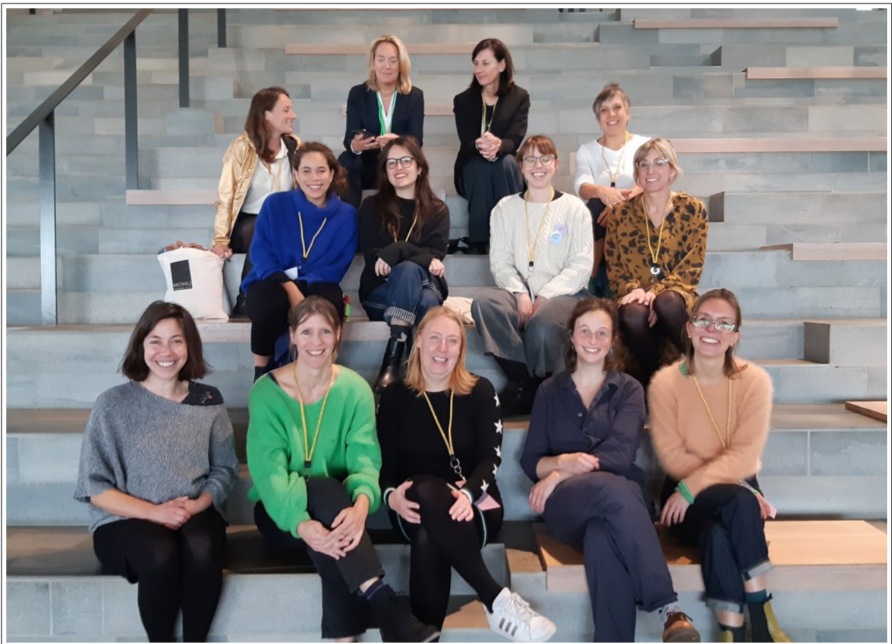
Belgian attendance at the ICOM CECA Europe Conference at Moesgaard Museum