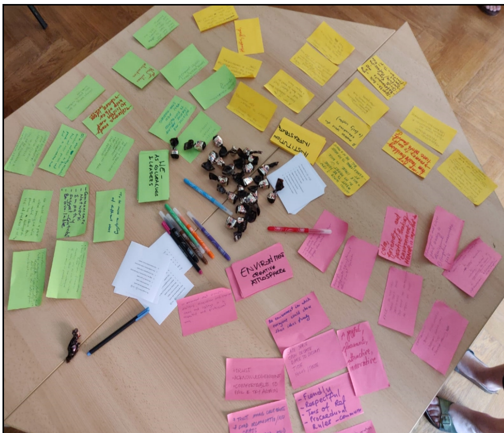
Impressions from the SIG Workshop in Prague, 25th August, 2022

This workshop is in unison with the ICOM CECA Europe Conference at Moesgaard Museum "Enjoyment" taking place from the 06.-08th October 2022.