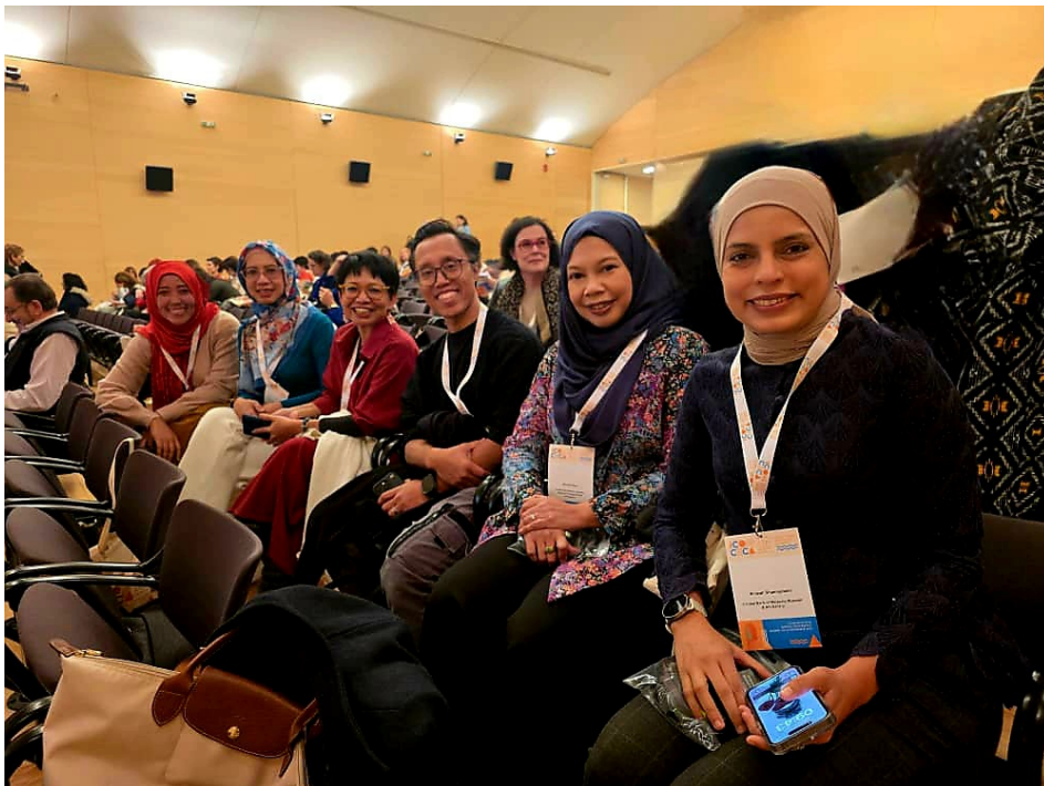
(ICOM-CECA members from Indonesia, Malaysia and Singapore at opening ceremony of ICOM CECA Annual Conference 2024 in Athens, Greece)

Glad to report that we have more members from this region participating in the ICOM CECA Annual Conference 2024 in Athens, Greece this year. The Asia Pacific countries represented at the conference included Australia, Indonesia, Japan, Malaysia, Singapore, South Korea and Taiwan.