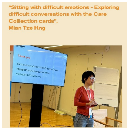
Above: Another workshop conducted by CECA member from Singapore on sitting with difficult emotions.

Overall, 2024 has been a good year for the Asia Pacific region but moving forward I hope to see more active involvement from members in this region. We are also aiming to bring the next annual conference to Asia in 2026.