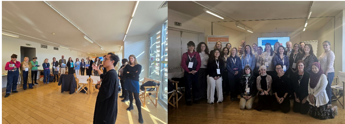
Above : Workshop conducted by Singapore and Malaysia CECA members on using theatrical tools to address delicate or sensitive topics in museums