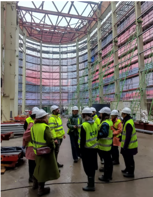
Figur 9 Brussel, Kanal-Pompidou, Erasmus+ program; Professional visit & networking lunch between 6 Belgian and 5 Austrian museums at Kanal-Pompidou. Organized by Stéphanie Masuy en Sofie Vermeiren in collaboration with ICOM Belgium