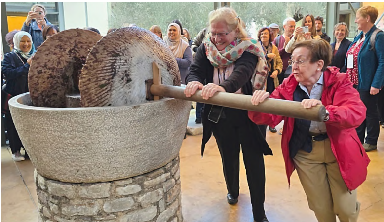
Figur 3 Interaction at the Museum of the Olive and Greek Olive Oil