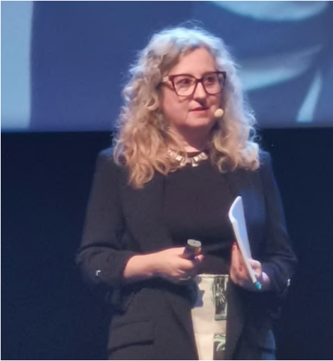
Figur 17 Museums, participation and social transformation