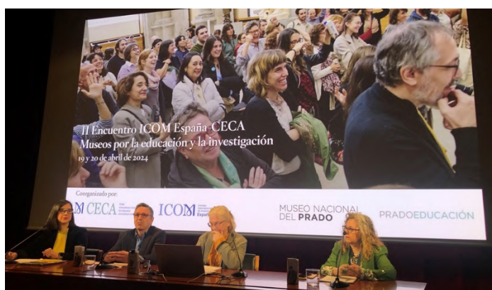
Figur 5 Inauguration II ICOM CECA Spain Conference