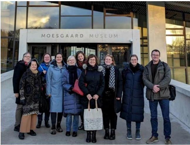
Figur 11 ICOM Denmark Seminar and Board Meeting at Moesgaard Museum 2024