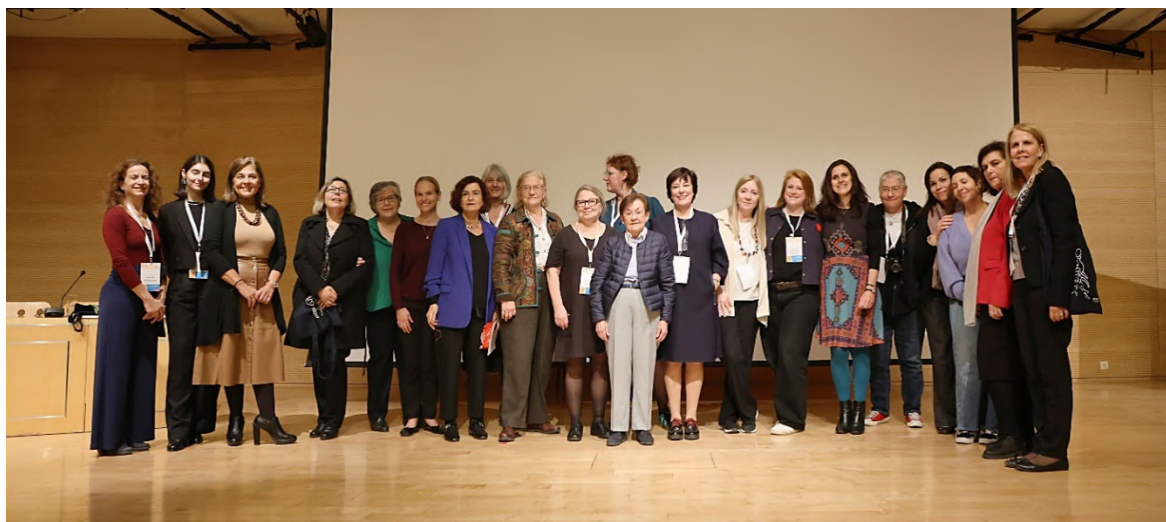
Figur 1 Closing the Athens Conference

For the Hellenic National Committee of ICOM and the Conference Organizing Committee, this major challenge was an extremely fruitful and rewarding experience, a unique opportunity for to welcome, communicate and create relationships with colleagues from all around the globe. We truly hope that the 2024 CECA Conference has enriched our reflection and has contributed to the reinforcement of a museum of inclusion, peaceful coexistence, mutual respect, democracy, polyphony and social justice.