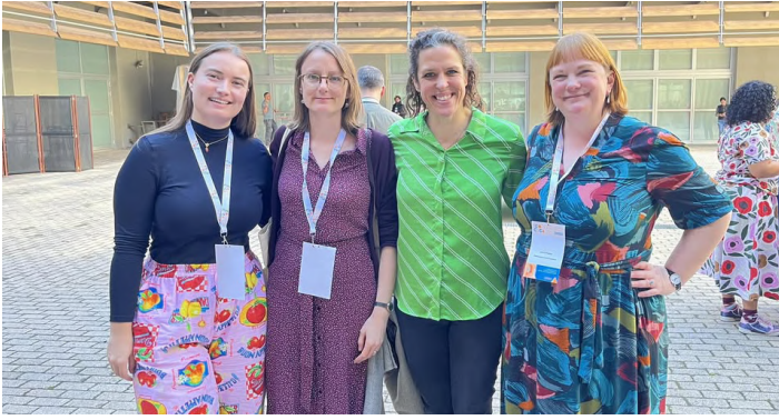
Figur 16 UK Members at the Annual CECA Conference in Athens 2024