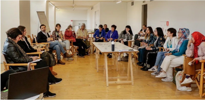
Figur 2 Discussions at the Workshop Room