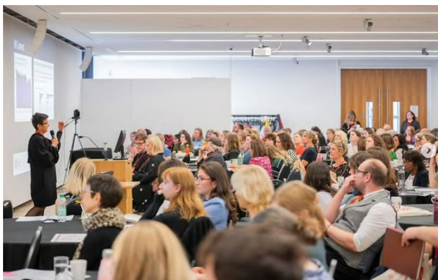
Figur 15 GEM Conference in Bristol 2024

21.11.24 participation at the European NC Meeting in Athens.